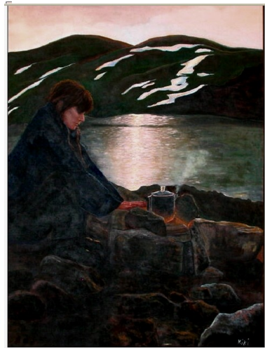
"Self portrait at Highland Mary Lakes"