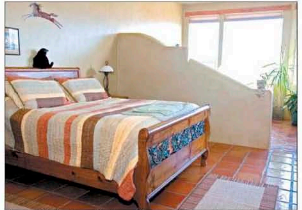
The master bedroom features Mexican tiling and great views.