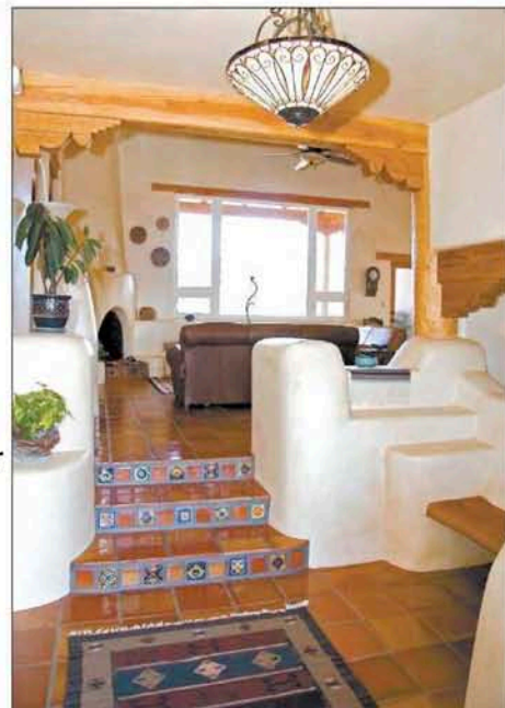
Hand-crafted wooden details abound throughout the house giving the home rustic appeal.

Classic New Mexico Homes concentrates on building about three homes each year. Construction of 3925 Desert Broom Court took approximately one year to complete.