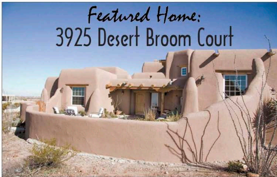
Featured Home: 3925 Desert Broom Court