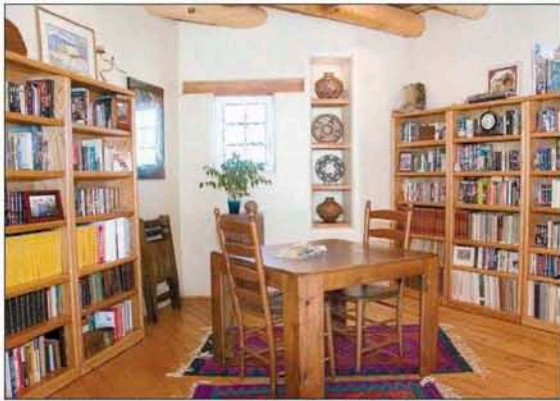
Directly above the sunken office is a loft that serves as the library.