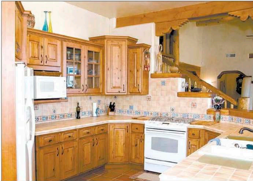
Tiles in soft hues of gentle pink and teal are set against a wooden backdrop in the home's kitchen, which overlooks the living room and dining area.