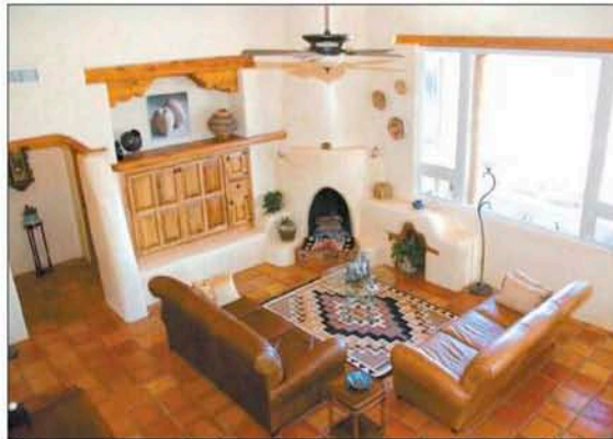
Sunny and warm, the home's living room also features fabulous views.

The sunny window seat features a floral trim design hand-painted by local artist Kiki Suggs. Suggs is responsible for the hand-textured walls and touches of artistry in each Classic New Mexico Homes project.