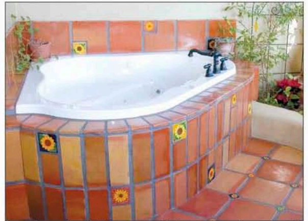
Great views, cheerful tile work, tropical greenery and a garden tub are featured in the home's bathroom.