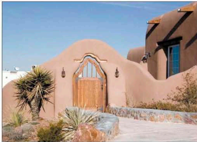
The traditional wooden front gate is a trademark of Classic New Mexico Homes and adds character, charm and privacy to each home.